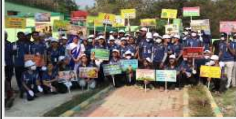
7:30 AM – 9:00 AM PRAVAT PHERI AND SWACHATA ABHIYAAN