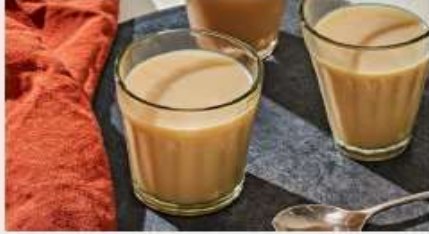
7:00 AM TEA AND BISCUITS