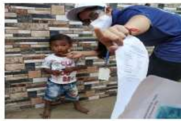
10:30 AM - 12:00 PM SURVEY