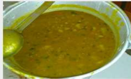
9:00 PM DINNER