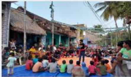
3:30 PM – 6:00PM NUKKAD NATAK