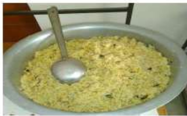
9:00 AM Breakfast